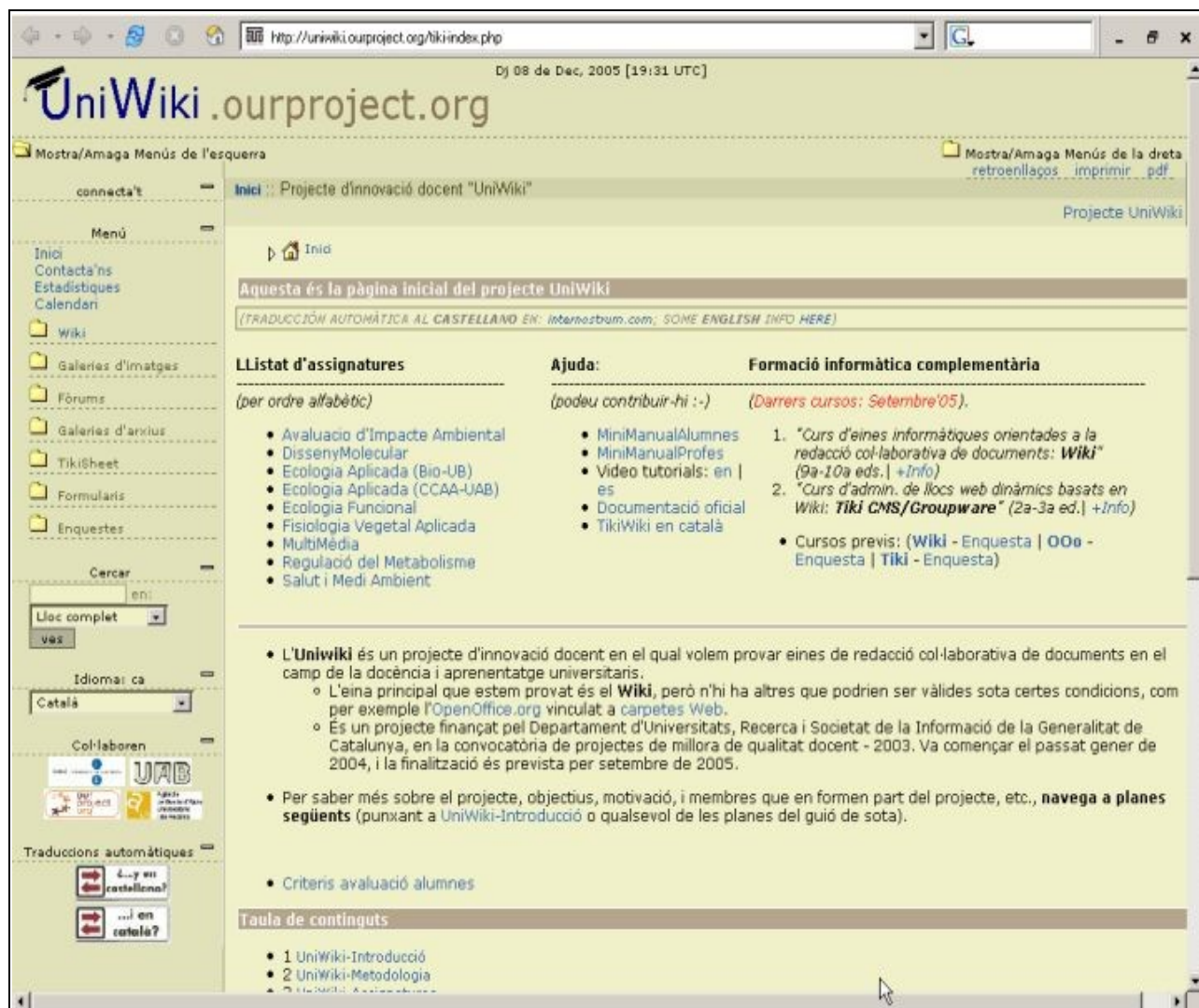
Figure 2. Main web site for coordination of the UniWiki project, where optional training for students and teachers was held a total of 10 times along the two years of the project.

After a pilot experience, TikiWiki CMS/Groupware collaborative portal web site ( http://tikiwiki.org ) was chosen as the main environment to enhance asynchronous communication and cooperative learning among students, as well as the basic environment of work for lecturers (Figure 2). Some courses were offered for training students on the tools and methodologies used, but unluckily only a few students joined them from the ones that would participate in the subjects later on. On the other hand, other students joined also the courses, and they were highly satisfied with them, according to the Students' Evaluation of Educational Quality (SEQ) survey they had to fill at the end of each one of them.